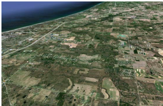
The Garvey Farm